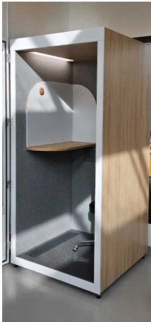
New Service desk, sustainability study room, study pod, and phone booth (Downtown Library).