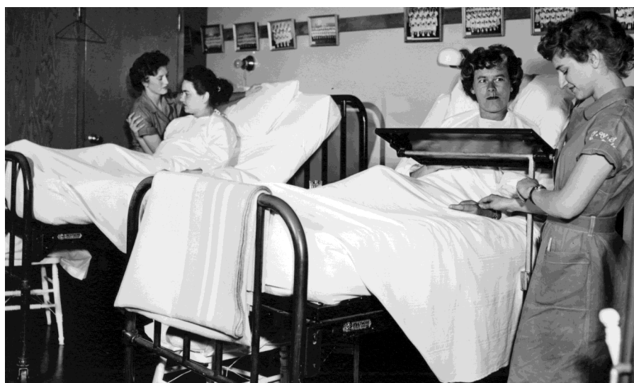
Photo Digitization Project -Practical Nursing Students 10/06/1959