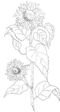
Figure 1: A sunflower.

Sunflowers are seed plants. They are dichotic angiosperms; therefore they have flowers and seeds, which are carried in the flower. The seeds, or fruit, of the sunflower are the basis of its reproduction. When planted, these seeds will grow to form another sunflower. Sunflowers have composite flowers, actually composed of many smaller florets. For example, each “petal” in a sunflower is actually a separate floret.